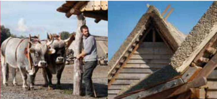
Freilichtlabor Lauresham (Laboratory for Experimental Archaeology) - life in the Carolingian age

BIZ Visitor Information Centre The museum’s educational service, complete with medieval kitchen, is located in the BIZ Visitor Centre. As well as housing the museum shop and ticket office, the BIZ is also the starting point for Lauresham guided tours.