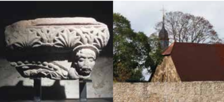
Schaudepot Zehntscheune (Exhibition Depot Tithe Barn) | View over the abbey wall