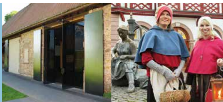
Schaudepot Zehntscheune (Exhibition Depot Tithe Barn)