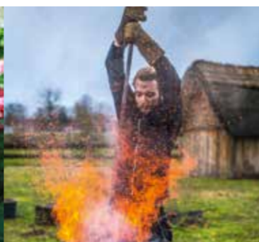
The Laboratory for Experimental Archaeology Laresham