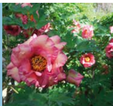
The Peony Garden