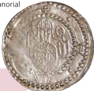
Silver coin from Lorsch, 2nd half of the 12th C.

Grounds of Lorsch Abbey, UNESCO World Heritage Site Major works have extended and enlarged the UNESCO World Heritage Site, significantly improving the visitor experience. The Altenmünster Abbey beside River Weschnitz and the abbey site in the town centre are now connected by a 2.5 km circular path. Highlights include the monastery mound featuring the Königshalle (King’s Hall), the church fragment, the monastery wall and newly-landscaped herb garden. The Schaudepot Zehntscheune (Exhibition Depot Tithe Barn) and the museum centre also illustrate the architectural and intellectual importance of the site in history. The model of the Carolingian manor (Lauresham) is unique in Europe and brings the subject of manorial nobility in the Early Middle Ages vividly back to life.