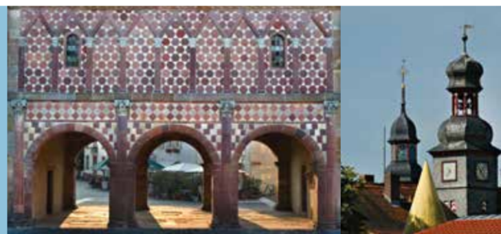
Facade of the King's Hall