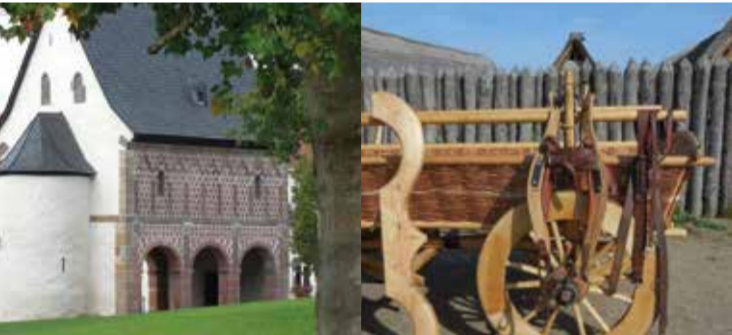
Königshalle (King’s Hall) (UNESCO World Heritage) | Freilichtlabor Lauresham (Laboratory for Experimental Archaeology)