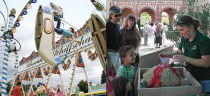
The St. John’s Festival | Nature research at UNESCO Geo-Naturpark

Lorsch is also home to the UNESCO Geo-Naturepark Bergstraße-Odenwald as well as the district Volkshochschule community college. Town festivals, club activities and cultural projects also form part of the rich tapestry of cultural life here, as does an institution that pulls people in from far and wide: the Sapperlot Theatre.