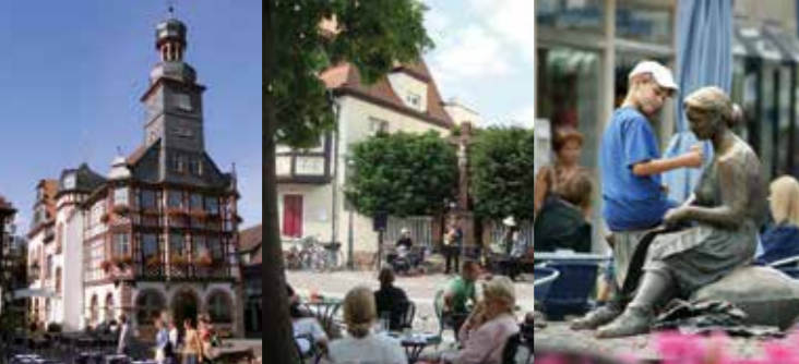
Historical Town Hall | Open air concert | The Tabakbrunnen Tobacco Fountain