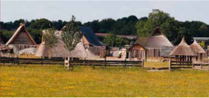
Freilichtlabor Lauresham (Laboratory for Experimental Archaeology) - life in the Carolingian age

TICKET AND GUIDED TOUR PRICES Access to the grounds of Lorsch Abbey (UNESCO World Heritage Site) is free. Certain offers can only be booked in combination with the purchase of an entrance ticket. A selection of tickets and tours can be found below.