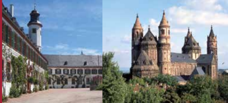
Seligenstadt Benedictine Monastery | St Peter’s Cathedral, Worms

FOR MORE INFORMATION KULTour@lorsch.de or www.lorsch.de